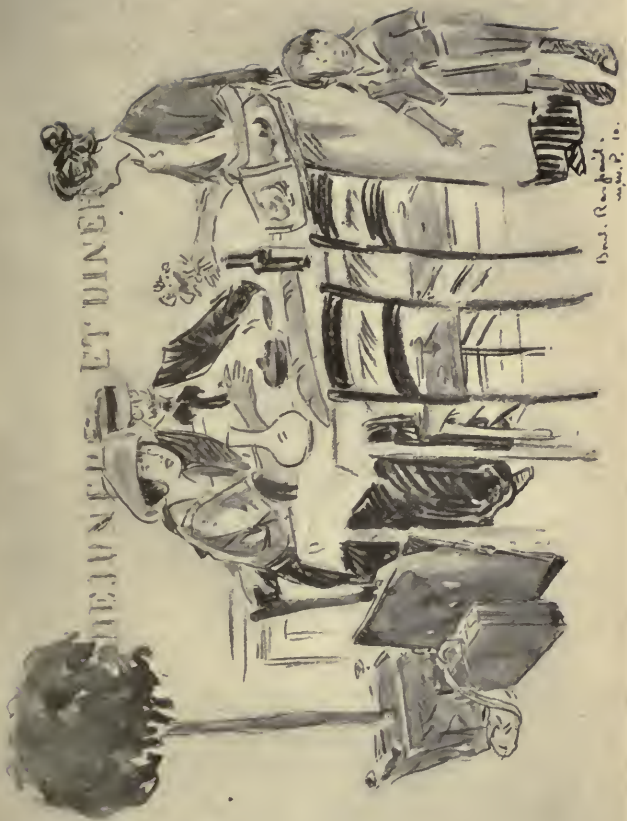
SHEDDING A GLAMOUR ON THE QUARTIER AND SOUP ON THEIR WINDSOR TIES.